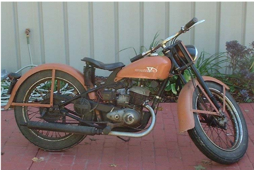
1955 Harley Hummer 125

Note the upturned cylinders on the Indian ala Moto Guzzi