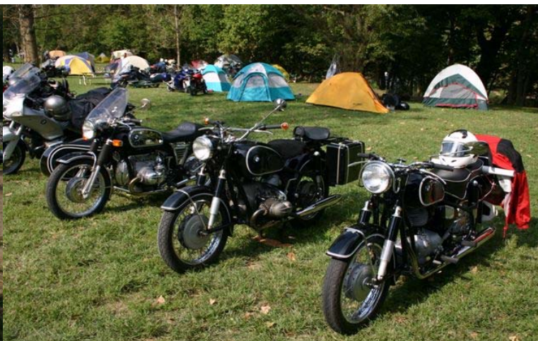
Lots of nice old BMW's