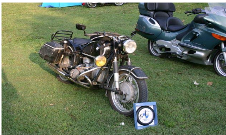
Oldest Bike Ridden to Rally Winner