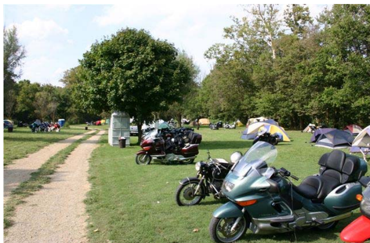
No Overcrowding this Year