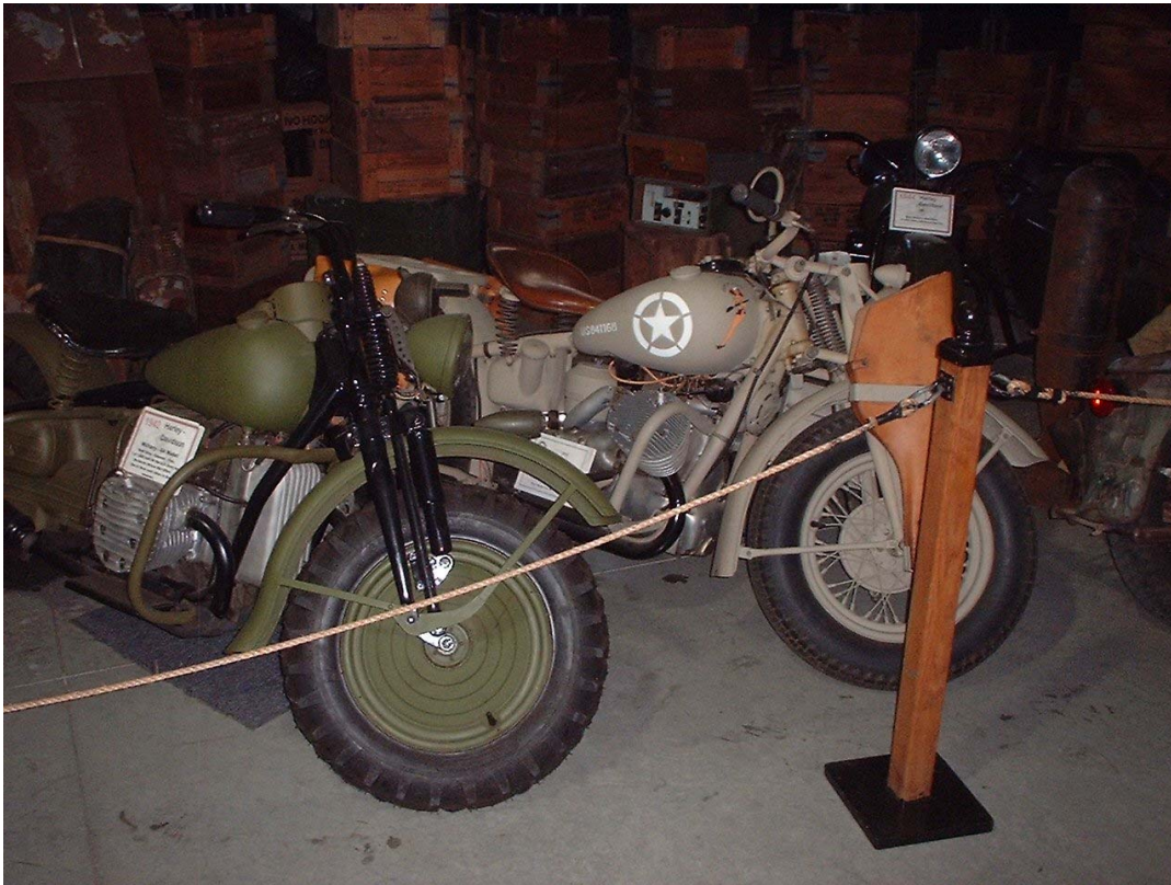
1943 Harley XA Military and a 1944 Indian Military

Note the upturned cylinders on the Indian ala Moto Guzzi