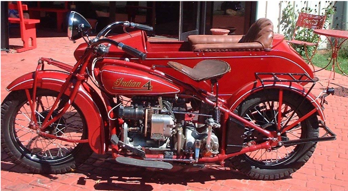
Indian 4 cylinder with a sidecar