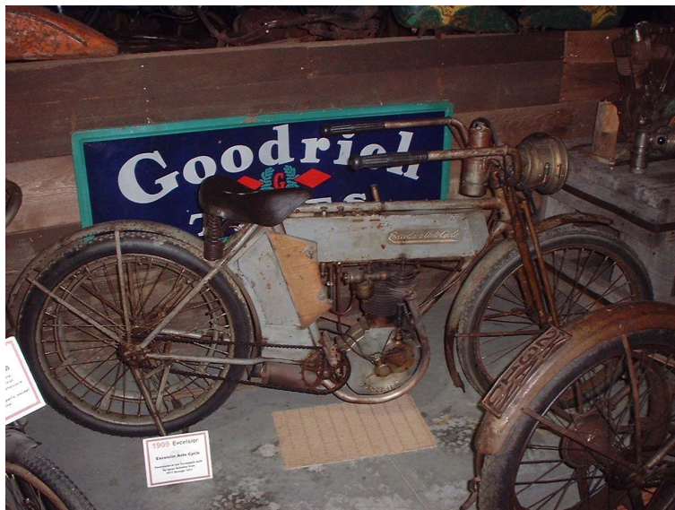
1909 Excelsior Autocycle