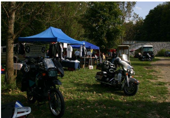
The view from camp