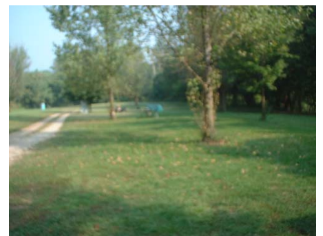
Setup day, Thursday 9/8/2005