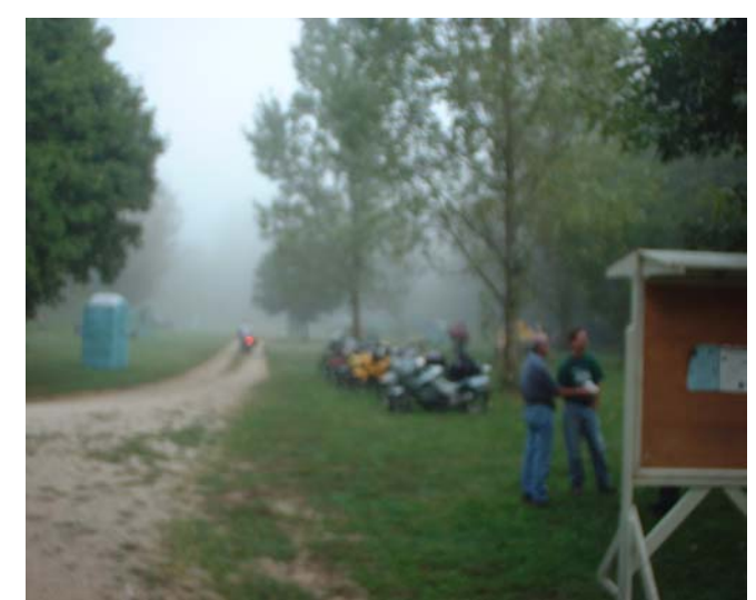
Foggy Friday, 9/9/2005