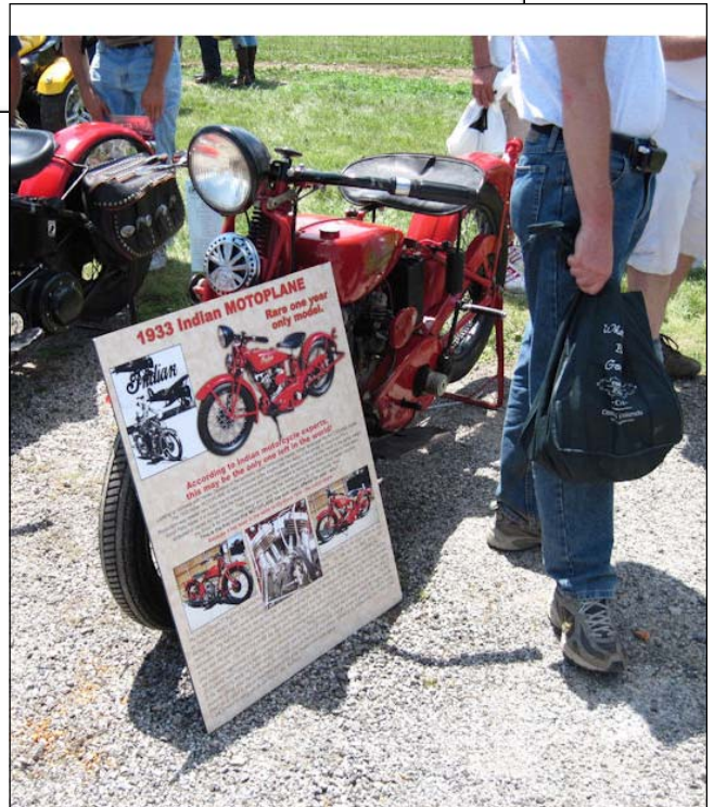
1933 Indian Motoplane