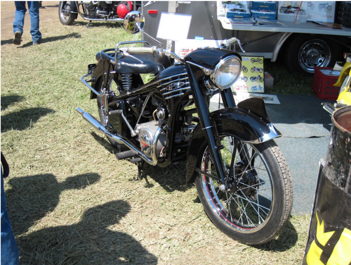
1954 Honda Dream 4E 220 cc 3 speed Sold only in Japan